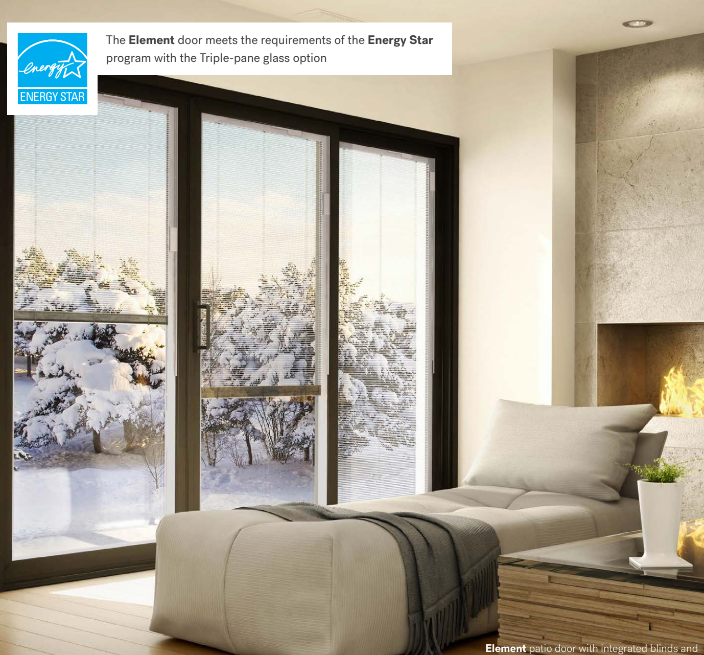
View handle in oil rubbed broze (paint) finish