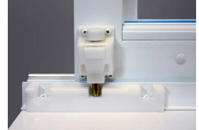
Three-position foot lock (Only available in white) (550, Element)

Double-point mortise lock (Shown with Look handle) (550, Element)